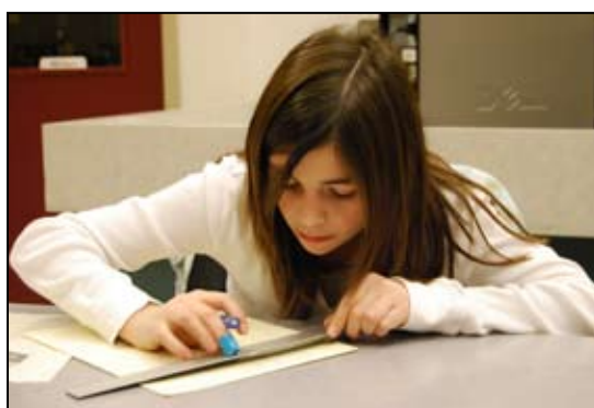
Straight Line to Technology - Middle School Students in the Gateway to Technology program go from learning basic drafting skills to building intricate Rube-Goldberg machines.