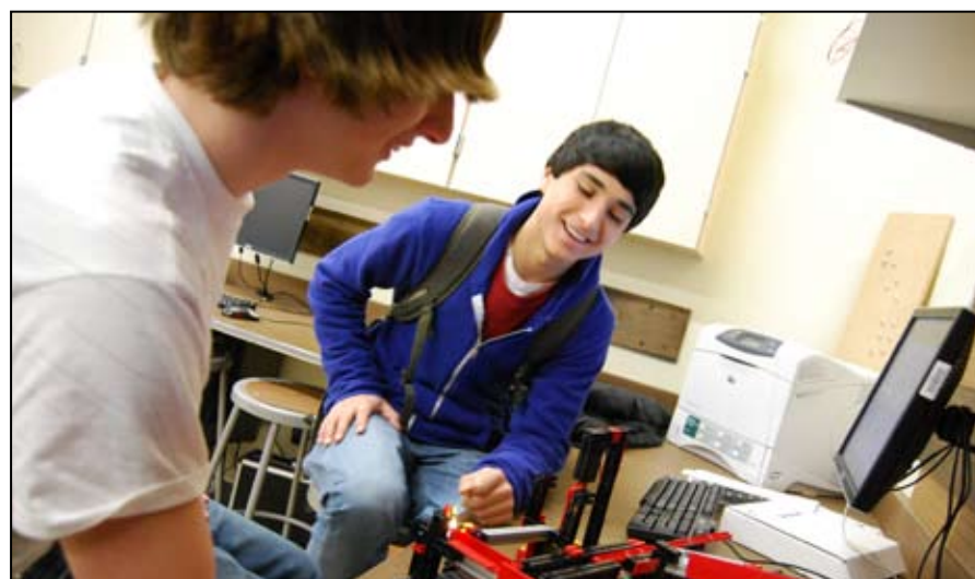
Leading Technology - Students in the Union High School Take the Lead Program use cutting edge technology to build complicated machines in order to learn more about engineering.