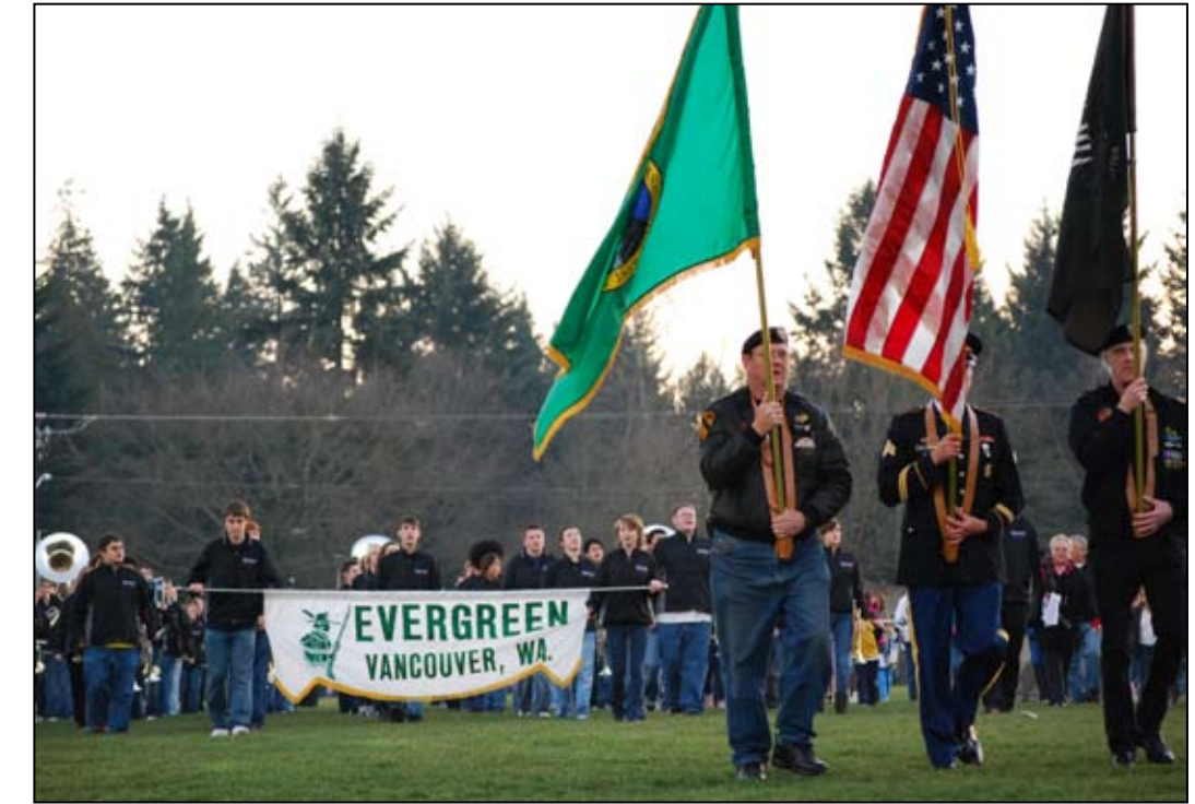
Community Send-Off - Evergreen High School performed "Washington My Home" at a community send-off event to thank parents and community members for their support in giving the band the opportunity to travel to Washington D.C.

In order to ensure that the money was not wasted, the band prepared a full itinerary of sightseeing in Washington,