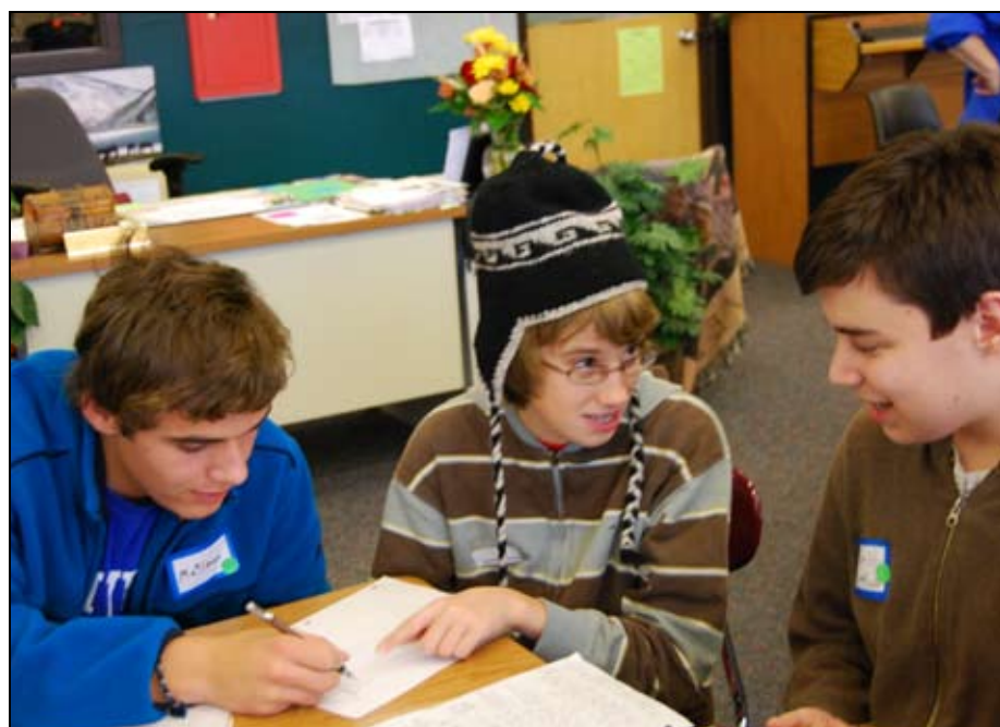
Peer to Peer - Students from Mountain View High School and Covington Middle School meet to discuss their thoughts and impressions of To Kill a Mockingbird , as part of a cross-age mentoring program.